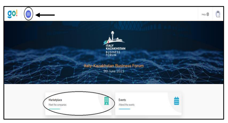
The marketplace will be activated for events with B2B meetings